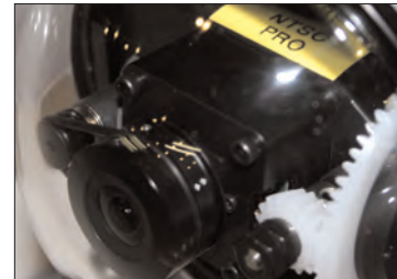
160° Vertical Tilt, Manual Focus Hi-Res Camera

Rear facing high resolution black & white 430 lines of resolution / 0.1 lux