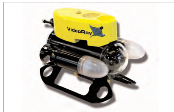
152m (500 ft) Depth Rated Pro 3 E

Two year limited warranty covering manufacturing and component defects. Upon or after warranty expiration this warranty can be renewed annually.