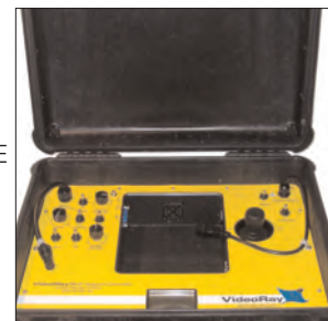
Simple Controls - Requires User Monitor