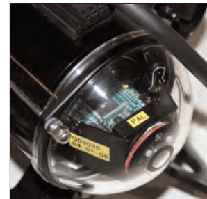
Rear Camera, LED Array, Accessory Port